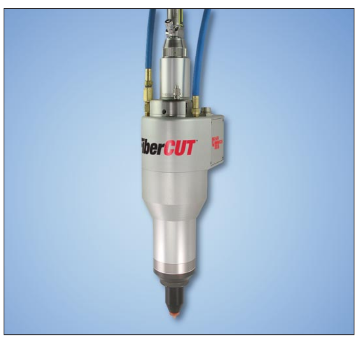
By locating all wiring and assist gas lines within the head, the potential for downtime due to snags and breaks is virtually eliminated.